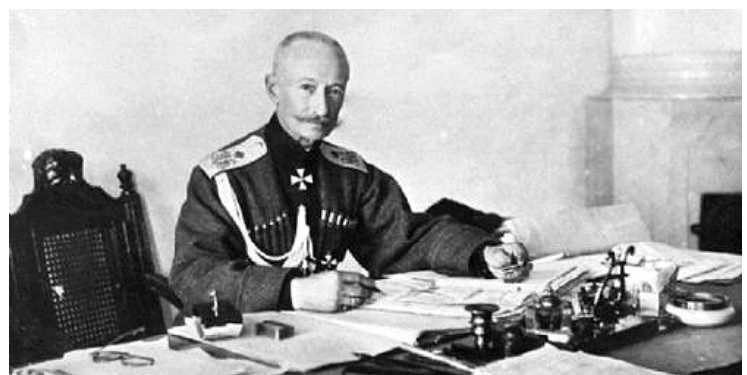
The Czar and Grand Duke Nicholas, Aleksei Brusilov