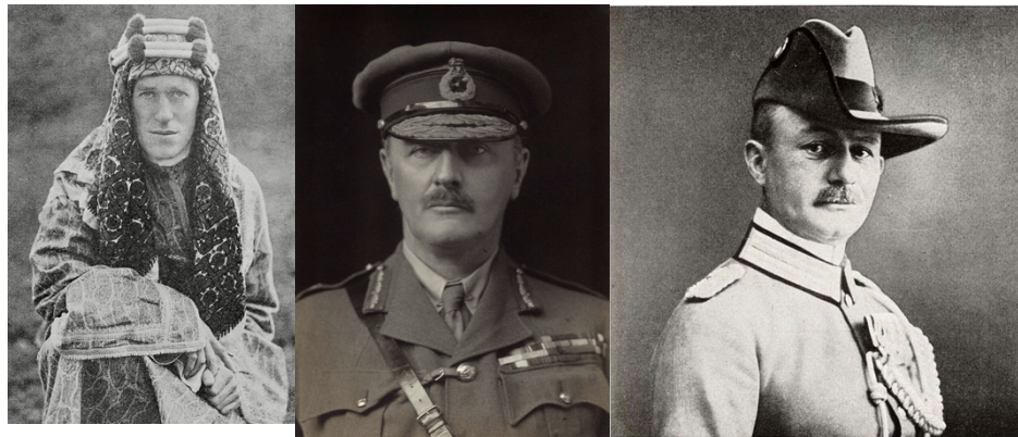
T. E. Lawrence, Edmund Allenby, Paul von Lettow Vorbeck