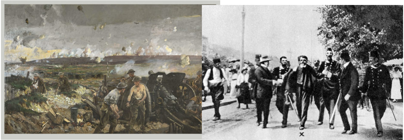
The Taking of Vimy Ridge, Easter Monday 1917 by Richard Jack. The arrest of Gavrilo Princip in Sarajevo, July 1914, and a merchant convoy at sea in 1918