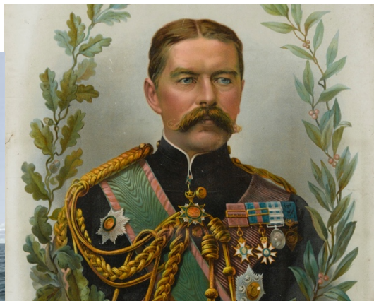
Sinking of the Lusitania , Lord Kitchener