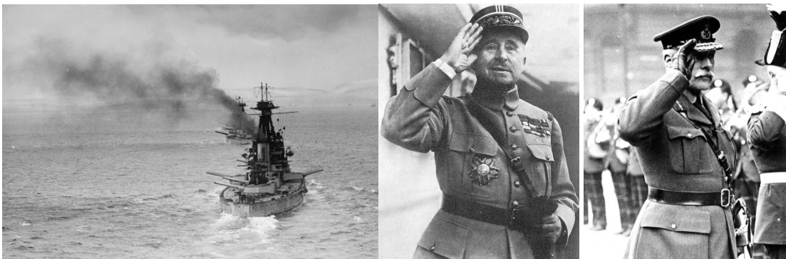
RN Grand Fleet dreadnoughts, Robert Nivelle, Field Marshall Sir Douglas Haig