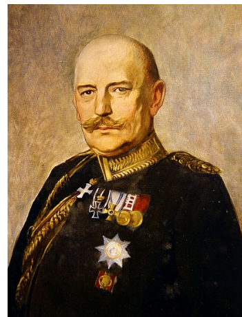
Franz Conrad von Hotzendorf, Chief of Staff of the Austro-Hungarian Army. Joseph Joffre, Commander-in-Chief of the GQG and the French Army. Helmuth von Moltke, Chief of the German General Staff.