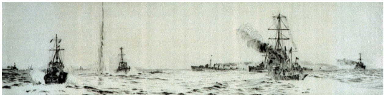
Depth Charge Attack, by William Wyllie